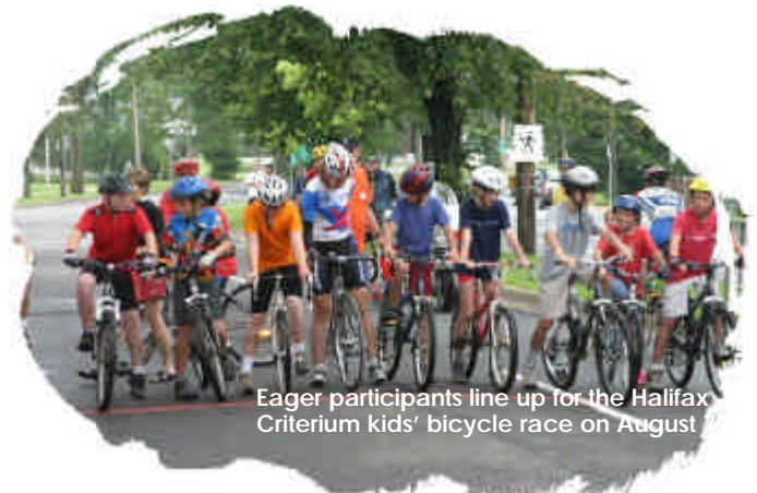
Eager participants line up for the Halifax Criterium kids' bicycle race on August 7

Buoyed by the success of this year’s race, the organizing team is already planning for next year.